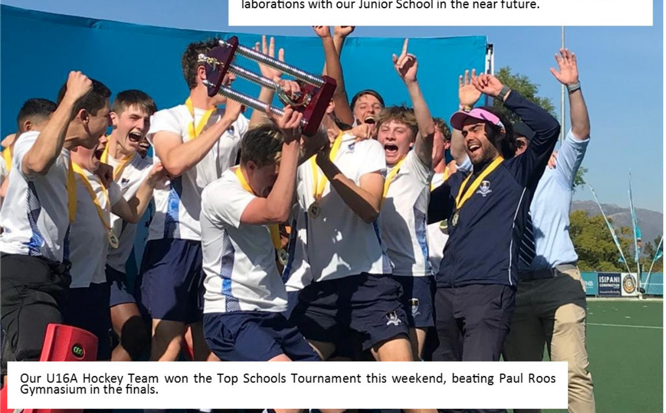
Our U16A Hockey Team won the Top Schools Tournament this weekend, beating Paul Roos Gymnasium in the finals.