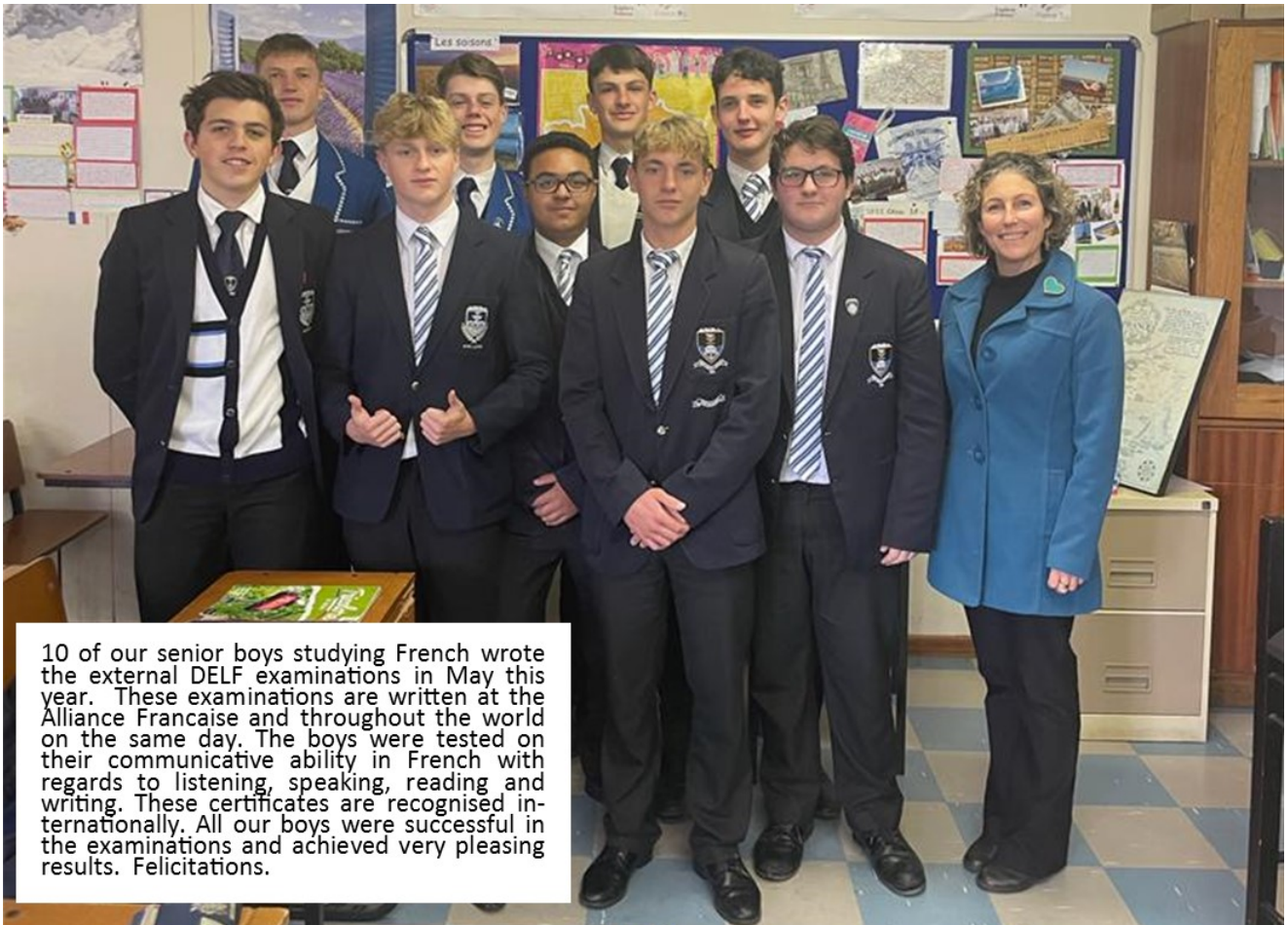
10 of our senior boys studying French wrote the external DELF examinations in May this year. These examinations are written at the Alliance Francaise and throughout the world on the same day. The boys were tested on their communicative ability in French with regards to listening, speaking, reading and writing. These certificates are recognised internationally. All our boys were successful in the examinations and achieved very pleasing results. Felicitations.