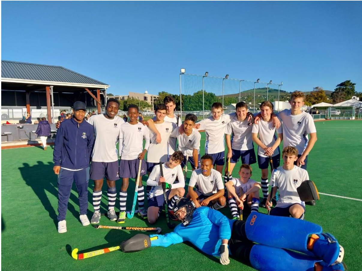
SACS U16D team after their game against Durbanville C team. SACS won 4-0.