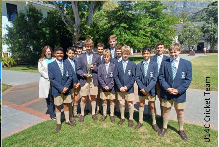
U14C Cricket Team