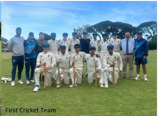
First Cricket Team