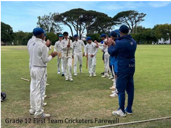
Grade 12 First Team Cricketers Farewell