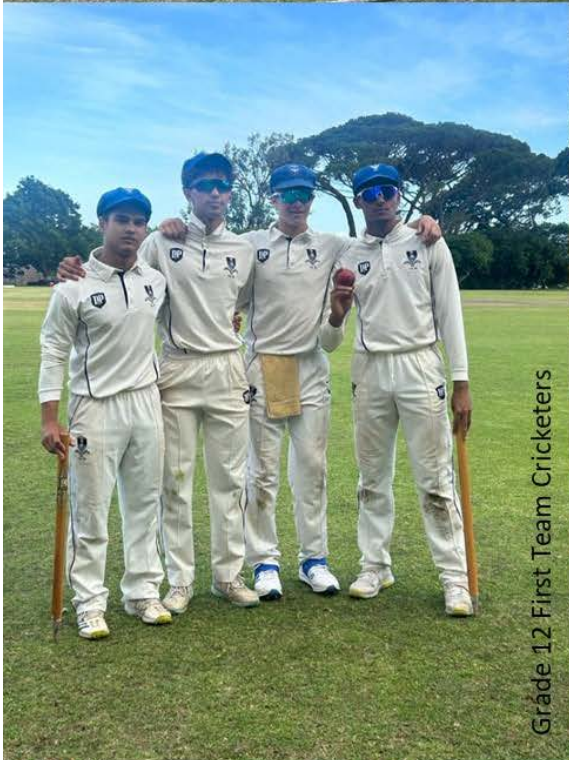
Grade 12 First Team Cricketers